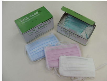
Face Mask (Non Woven) Size : 18 x 9.5cm Spec : 3 Ply, 4 Ribbon / 2 Elastic, Supersonic / Sewing Packing : 50 pcs/box, 40 boxes/carton