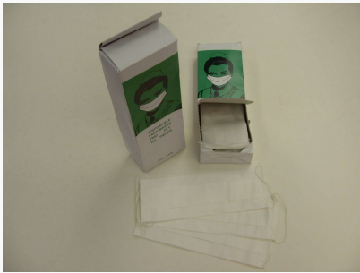
Face Mask (Paper) Size : 20 x 7 cm Spec : 1 Ply / 2 Ply, Rubber Band Packing : 100 pcs/box, 100 boxes/carton