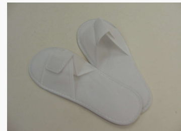
Disposable Slippers Size : 27.5 x 10.5cm Spec : 30G/M 2 , with Velcro Packing : 50 pairs/bag, 8 bags/carton