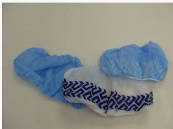
Shoe's Covers Size : 40 x 16cm Spec : 40G/M 2 , with Elastic / Slip Proof Packing : 100 pcs/bag, 10 bags/carton