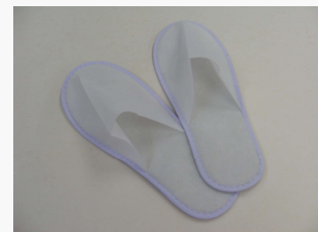
Disposable Slippers Size : 27.5 x 10.5cm Spec : Covered Front Packing : 50 pairs/bag, 8 bags/carton

GRACEDUTY COMPANY LIMITED Room 1102 - 1104, 11/F., CRE Centre, 889 Cheung Sha Wan Road, Kowloon, Hong Kong, China Tel: (852) 2420-5808 (6 Lines) Fax: (852) 2420-5507 E-mail : medical@graceduty.com.hk http://www.graceduty.com.hk