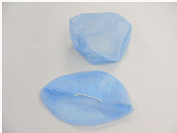
Doctor's Cap Size : 11.5 x 62cm Spec : 14G/M 2 Long Filament, 1 Ply / 2 Ply 30G/M 2 Long Filament Packing : 100 pcs/bag, 10 bags/carton