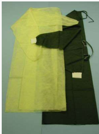
Surgical Gown Size : 115 x 145cm Spec : 30G/M 2 , with Knitted Cuff / with Elastic Cuff Packing : 10 pcs/bag, 10 bags/carton