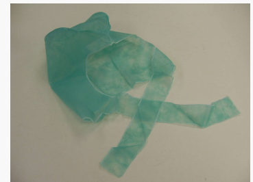
Surgical Hood Size : 11.5 x 62cm Spec : 18G/M 2 / 30G/M 2 Long Filament Packing : 100 pcs/bag, 10 bags/carton